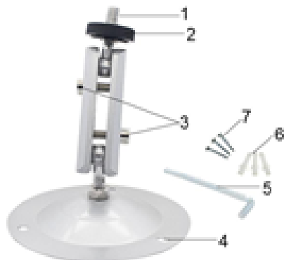
Fig.3. Wall bracket

You can mount the camera permanently on a wall or tree using the supplied wall bracket. Before mounting the wall bracket you should ensure that all existing screws are tight. The best installation height distance from the ground about 1 meter.